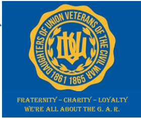
LOGO ON FRONT ONLY

One shirt is a Women's V-neck, 50/50 cotton poly blend, comes in Royal blue with DUVVCW Logo on front, We're All About the G. A. R. logo on back and is